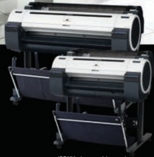
iPF670 shown with stand

Affordable printers for those looking for an entry-level, multipurpose, large-format printer.