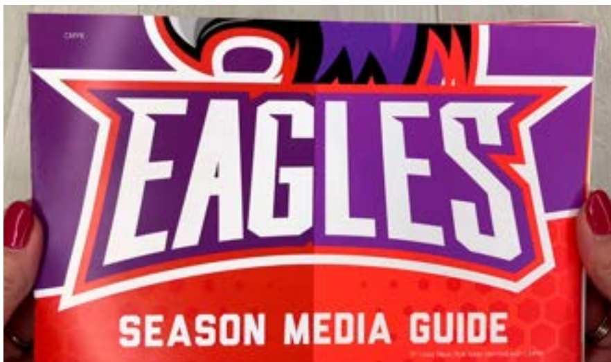
5 th Color Neon Pink toner blended with CMYK