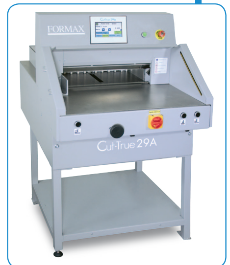
Standard model, without optional wide side tables

Formax – New Hampshire, USA www.formax.com