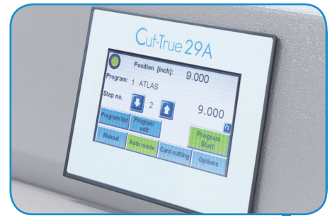
Full-color touchscreen control panel allows for programming up to 100 jobs

* 31"W with safety curtains removed for easier transport through doorways. 33.5"W including safety curtains.