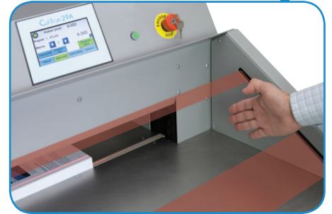
Infrared Safety Curtain shuts down operation if the beam is interrupted